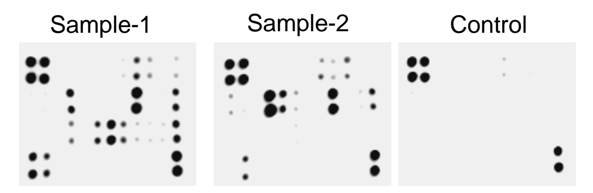
Typical results obtained with RayBio® C-Series Antibody Arrays

The preceding figures present typical images obtained with RayBio® C-Series Antibody Arrays. These membranes were probed with conditioned media from two different cell lines. Membranes were exposed with Kodak X-Omat® film at room temperature for 1 minute.